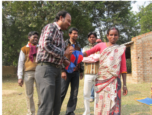
Figure 3: Draw of stage

Note: This picture shows the public random draw of the third-party punisher.