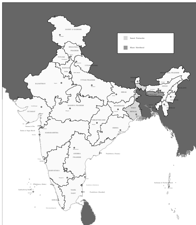
Figure 1: Location of research area

Note: This map shows the location of the states in India, where the study was conducted. The matrilineal Khasi are located in the state of Meghalaya, the patriarchal Santal in the state of West Bengal, both states are in the north-east of the Indian subcontinent.