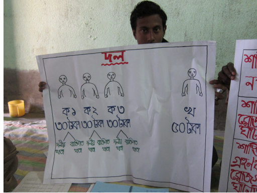
Figure 2: Explanation of Game

Note: This picture shows the research assistant explaining the public good game.