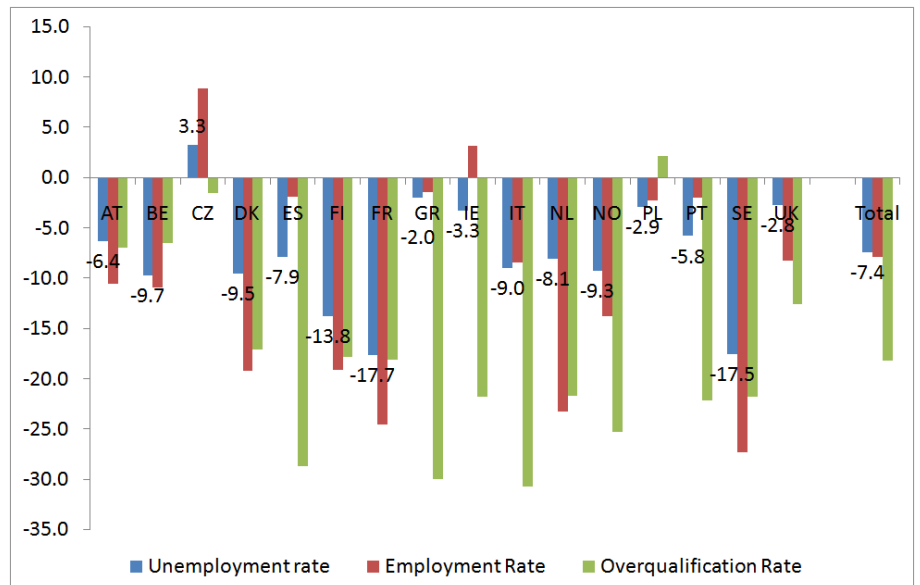
Figure 2: Differences in unemployment, employment and over-qualification (foreign-born vs. natives)