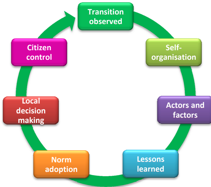
Figure 2: Research questions derived from the SES transition model

cated an exploratory approach to the field. The strength of the framework lies in its openness to produce explorative insights in the field, which later can be assessed by other scientific means.