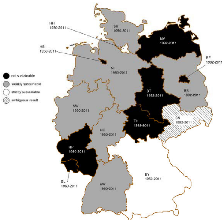
Figure 3 Fiscal Sustainability in German Laender

Note: The years indicate the start and end dates of the time series. For abbreviation of the Laender, see Figure 1.