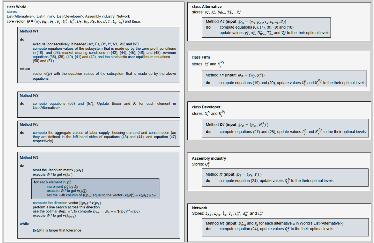
Fig. 1. Schematic depiction of the object-oriented solution algorithm.

I1 that can access e in order to use it as an input (see above). Call of A1 implies a subsequent call of W2 because systematic utilities (i.e. the input of W2 ) are altered by A1 . In contrast, changes in produced quantities Q_j^S , H_i^S or Y imply that A1 and W2 are skipped because household behavior remains intact in the current iteration.