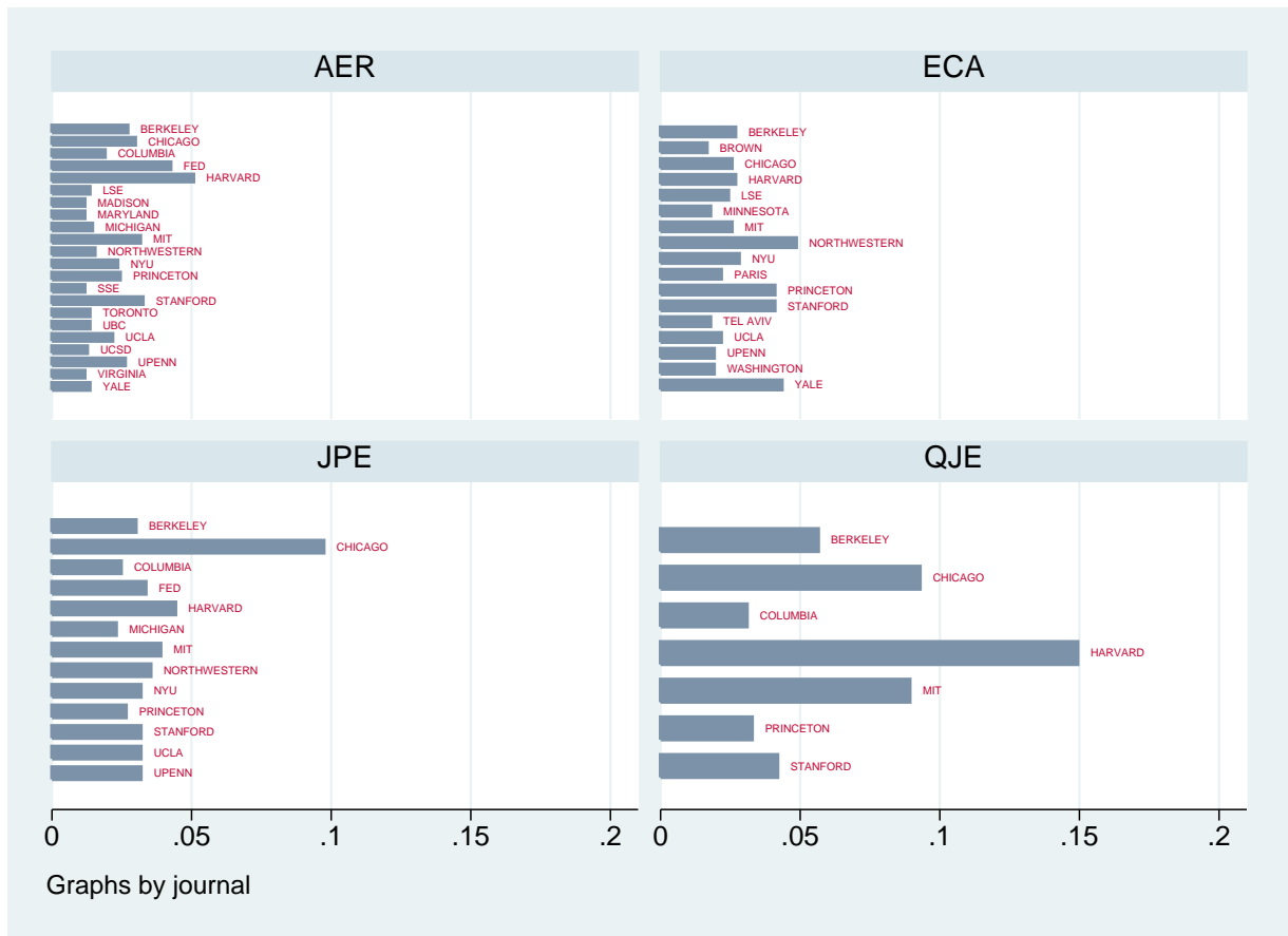
Figure 2: Authors' institution of appointment, by journal

Notes: The figure plots the academic institutions that account for the first 50% of published articles over the period 2000-2006. These are institutions of appointment at the time of publication.