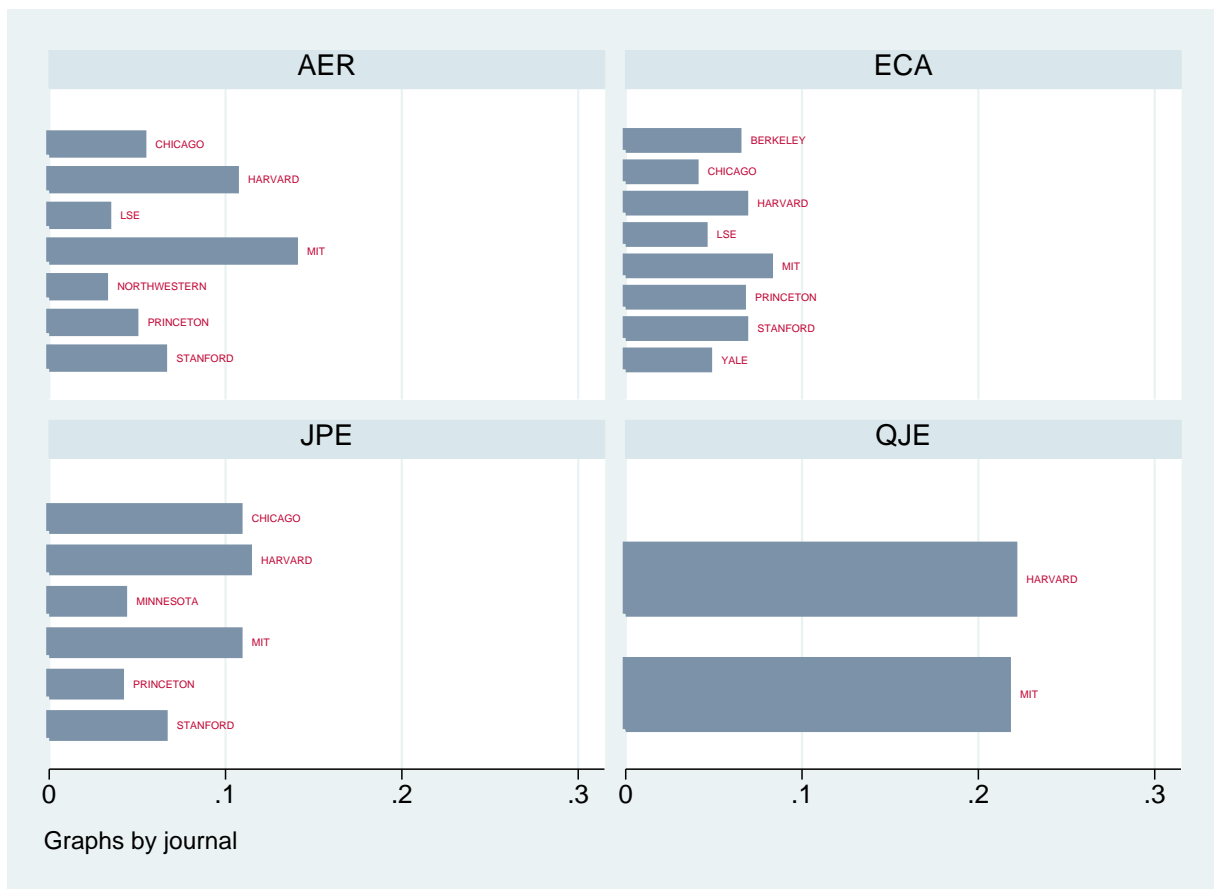
Figure 3: Authors' institution of PhD award

Notes: The figure plots the PhD institutions of authors that account for the first 50% of published articles over the period 2000-2006.