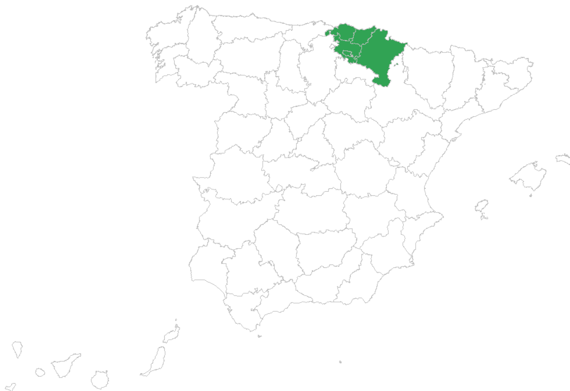
Figure 1: The foral autonomous communities of Navarre and the Basque Country

In this context in 1959 a group of Basque students founded the extreme left-wing terrorist organization ETA ( Euskadi Ta Askatasuna , Basque acronym for “Basque Homeland and Freedom”) with the political objective of achieving the establishment of an independent Basque state 29 . ETA carried out its first terrorist attack in 1968 and since then its violent and paramilitary activity has claimed more than 800 lives and many more victims in Spain until the allegedly definitive cessation of its armed activity declared on 20 October 2011. In Figure 2, I report the distribution of killings due to ETA’s attacks by Spanish provinces. The picture shows that the majority of attacks were perpetrated in the Basque and Navarrese provinces but that also Madrid and Barcelona have been frequent targets.