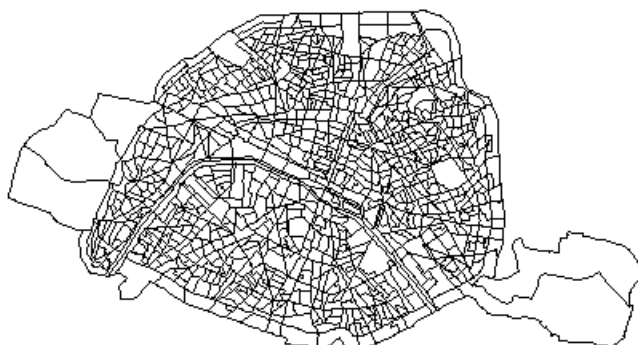
Figure 1: Paris map of IRISes