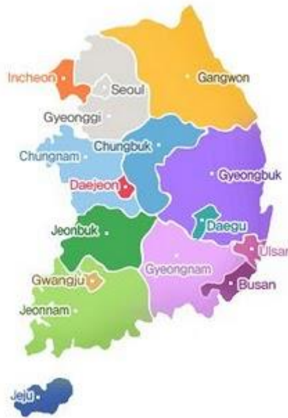
Figure 2. Map of South Korea

In order to examine the effect of trade openness on the regional inequality of South Korea, this study uses a panel dataset of 16 regional units (nine provinces and seven metropolitan cities). 2 All datasets are collected from the archival materials at the Korean Statistical Information Service (KOSIS). Generally, most datasets cover from 2000 to 2012. But because of the dearth of information, the dataset related to infrastructure covers less of the period of time than the others.