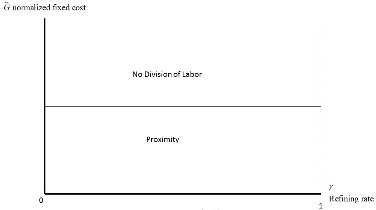
Figure 3: Production regimes in space (\gamma, \widehat{G}) for f = 0.4