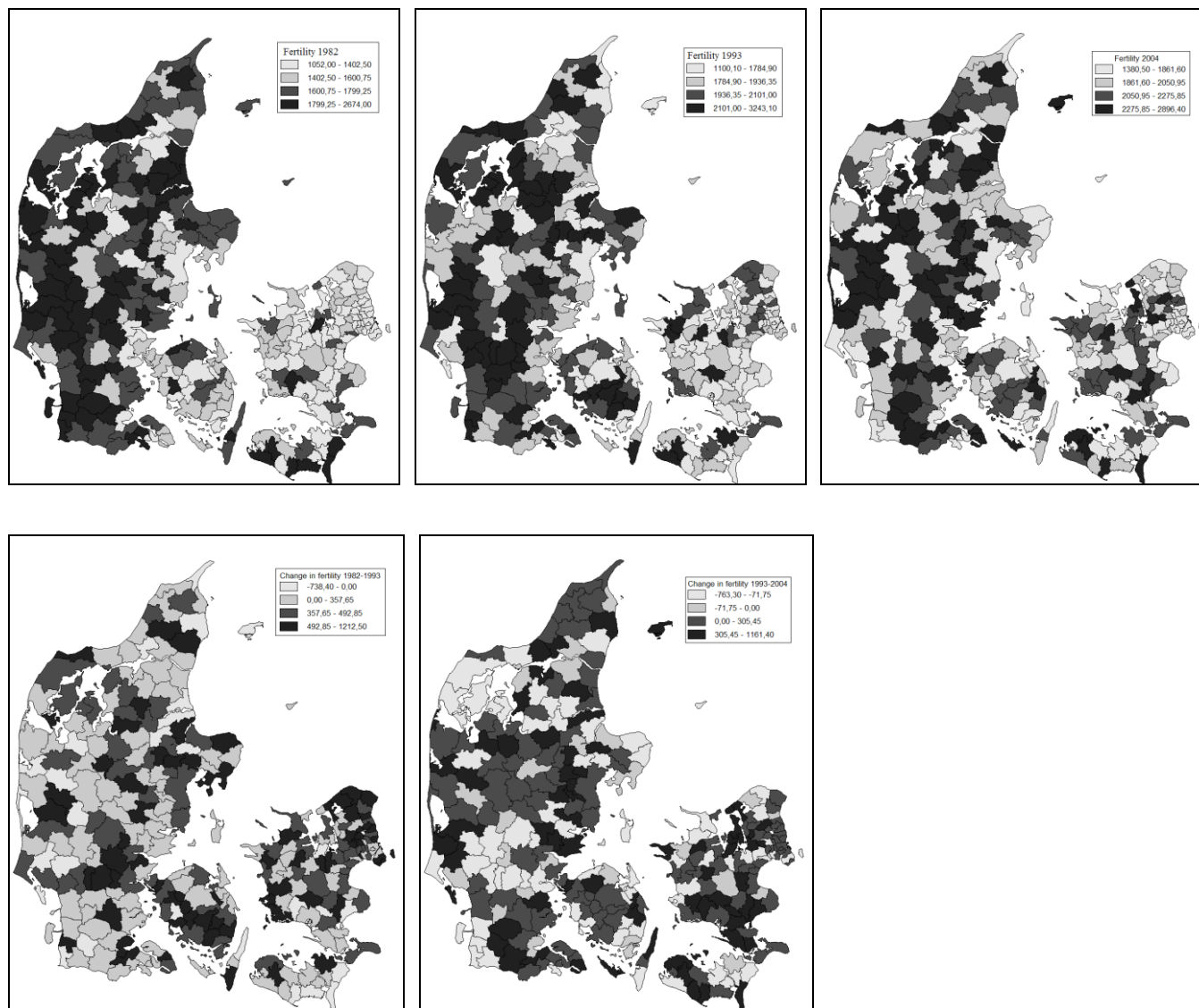
Figure 3. Fertility rate and change by municipalities