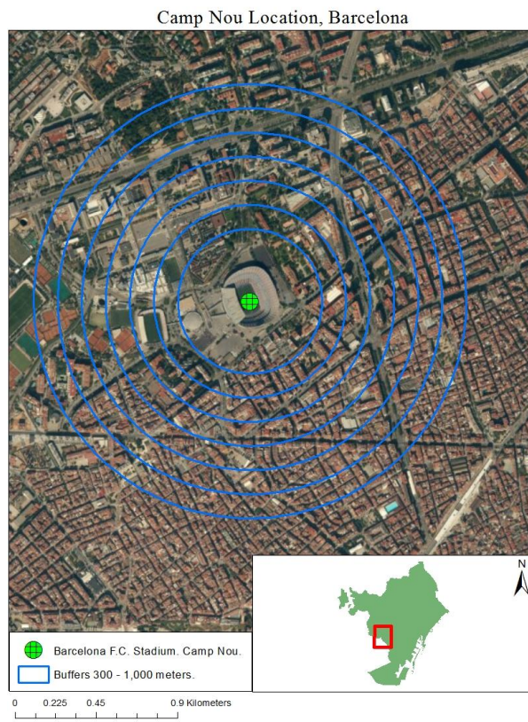
Map A1. Cumulative rings (buffers) around FCB's stadium.