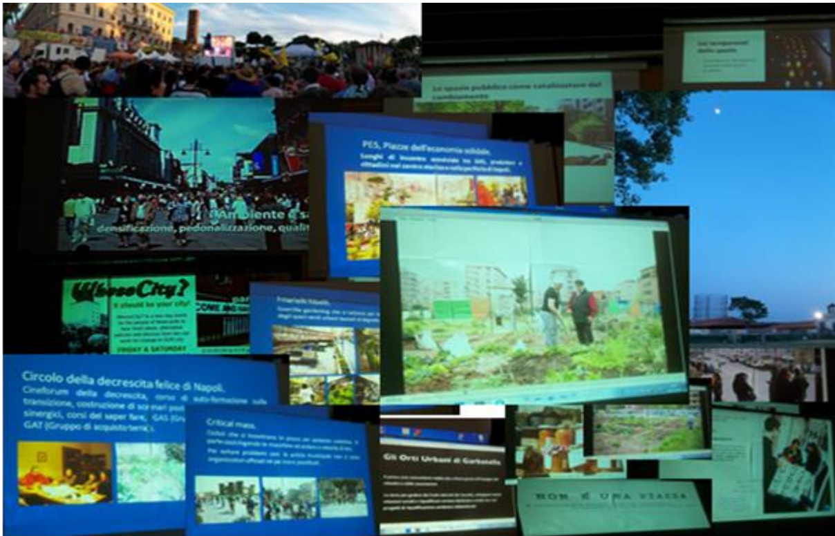
Figure 3 - Images from The First Biennial of Public Space (2011, Rome) and the celebration of the Referendum for the maintenance of public management of water and no nuclear power in Italy.

The “tele-assistance” of the Social Master Plan shows that the many innovations discussed, should be coordinated and structured by planning tools, design and programming. Remote energy, solar panels, wind Hydropower, smart phones and services, transport “on call”, decentralization of electricity production, “cloud connections” can give great benefits to the community but only if it is aware, informed and formed either as residents, citizens, and either as technicians, administrators and politicians.