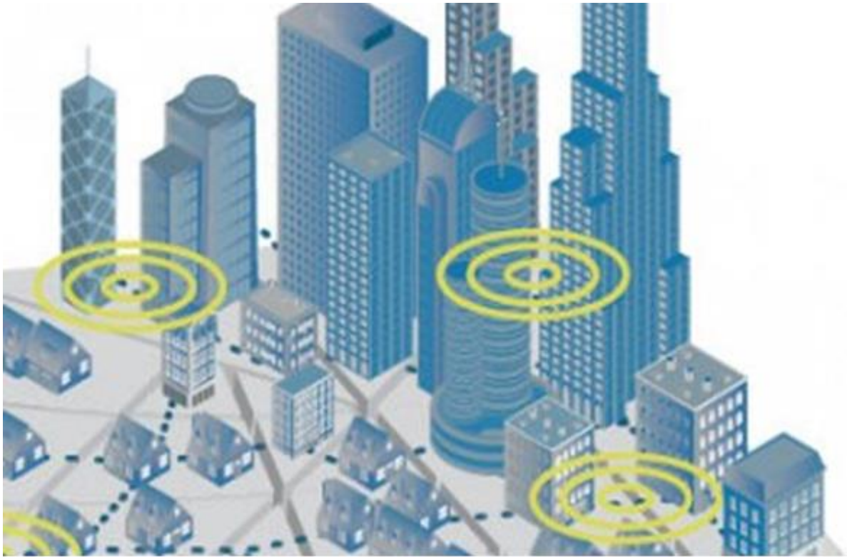
Figure 1 - The City of "Smart Grids"