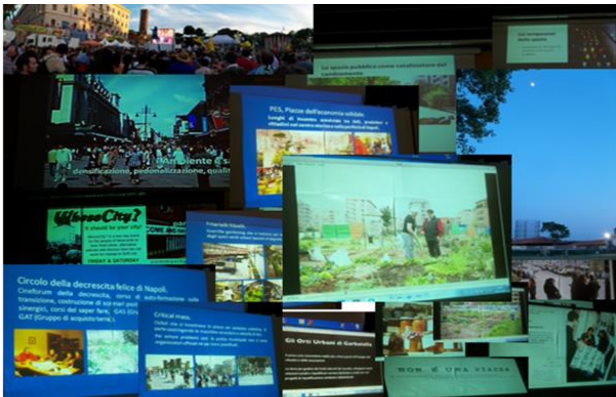
Figure 3 - Images from The First Biennial of Public Space (2011, Rome) and the celebration of the Referendum for the maintenance of public management of water and no nuclear power in Italy.

The “tele-assistance” of the Social Master Plan shows that the many innovations discussed, should be coordinated and structured by planning tools, design and programming. Remote energy, solar panels, wind Hydropower, smart phones and services, transport “on call”, decentralization of electricity production, “cloud connections” can give great benefits to the community but only if it is aware, informed and formed either as residents, citizens, and either as technicians, administrators and politicians.