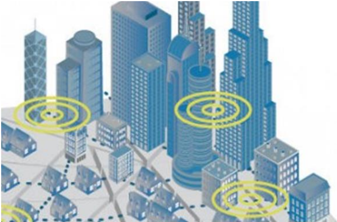
Figure 1 - The City of "Smart Grids"