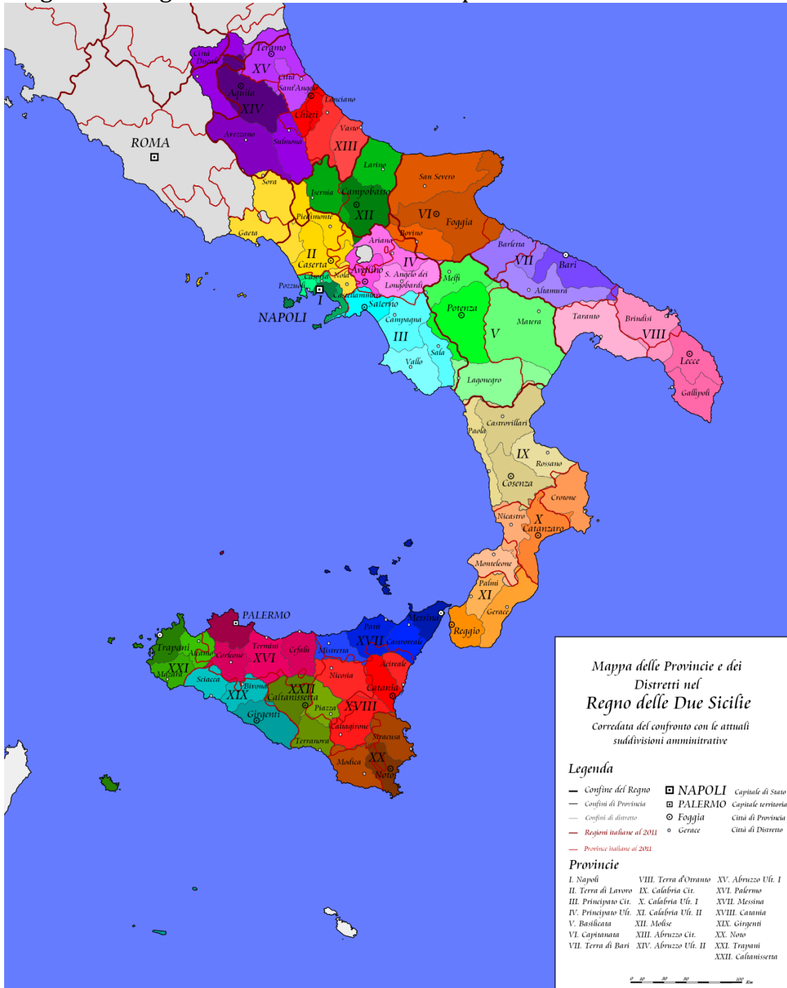
Figure 1. Kingdom's border and current provinces' boundaries