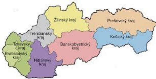
Figure 1: 8 High territorial units (regional government) in Slovakia

22.90%, year 2005 – 18.02%, year 2001 – 26.02 % 8 ). This situation is only made worse by the fact that Slovakia has not yet approached the implementation of municipal reform in the field of consolidation of settlement structure, and requirements on the coordination role of regional self-governments in the area of integrated development are therefore, higher.