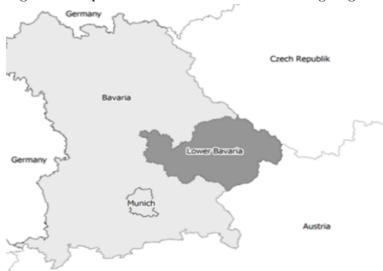
Figure 1: Map of Lower Bavaria and Surrounding Regions a

a Map of Lower Bavaria and the surrounding German, Austrian and Czech regions, whereby Lower Bavaria is depicted by a dark coloring and Bavaria by a grey coloring.