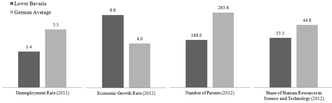
Figure 2: Lower Bavarian Economic Performance and Innovativeness Indicators

agglomeration center, their economic performance and their regional R&D. This list illustrates that it may be reasonable to conceive Lower Bavaria as an archetype for a specific type of European region that has not been conclusively examined in previous research.