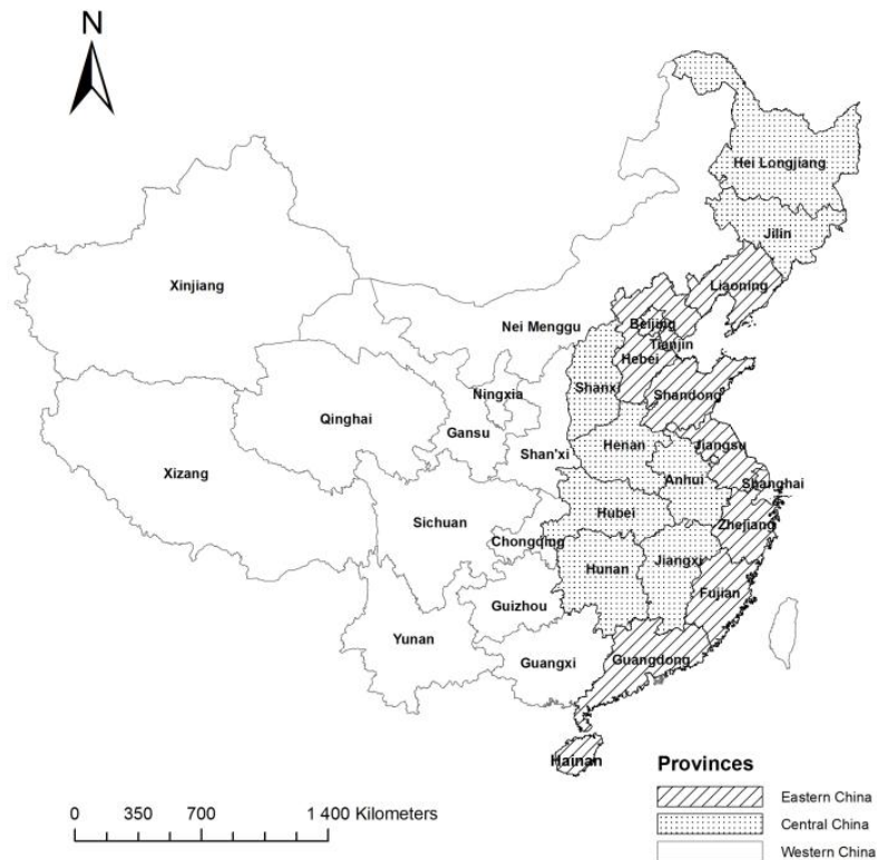
Figure 2 Provinces and the Three Regions in China

The fundamental purpose of promoting IURD is to break down institutional barriers, and to achieve coordinated urban and rural development by strengthening urban-rural linkages (Chen and Li, 2004; Luo and Li, 2005). Ye (2009) lists three main rubrics of IURD in China: deployment of key factors between urban and rural areas; supply of primary public goods and services (infrastructure, compulsory education, health care and social insurance) in urban and rural areas; allocation of public resources between urban and rural areas (this subsumes the previous two rubrics). Basically, the IURD covers many aspects in the socioeconomic and environmental fields and the data availability challenges the feasibility of assessing IURD. In the paper, we try to investigate the urban-rural differences which can, from the opposite side, indicate the level of IURD. If there is big/small urban-rural difference of a certain province, then, the level of IURD of this province would be low/high. We believe that the deployment of key factors, provision of public goods and