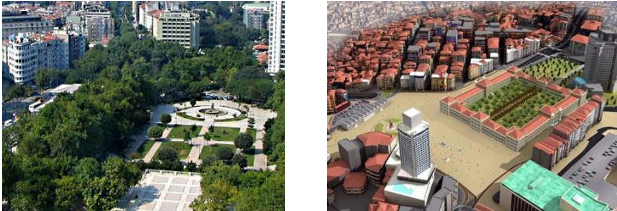
Figure 5: Taksim Gezi Park and Proposed Military Barrack

support of the park's protection. Nearly 60 such organizations attended the first meeting to express their claims on their "commons" and denominated the group as "Taksim Solidarity" by signing a common declaration. Just a few weeks after the first call, the number of organizations having signed the taksim declaration had increased to more than 120 while the structure of the group now being called Taksim Solidarity had tremendously diversified now including labor unions, chambers, neighborhood organizations, ngo's, political parties, other CSO-platforms and citizen initiatives. The group decided to execute the secretarial issues of the solidarity through Chambers of Architects and Urban Planners.