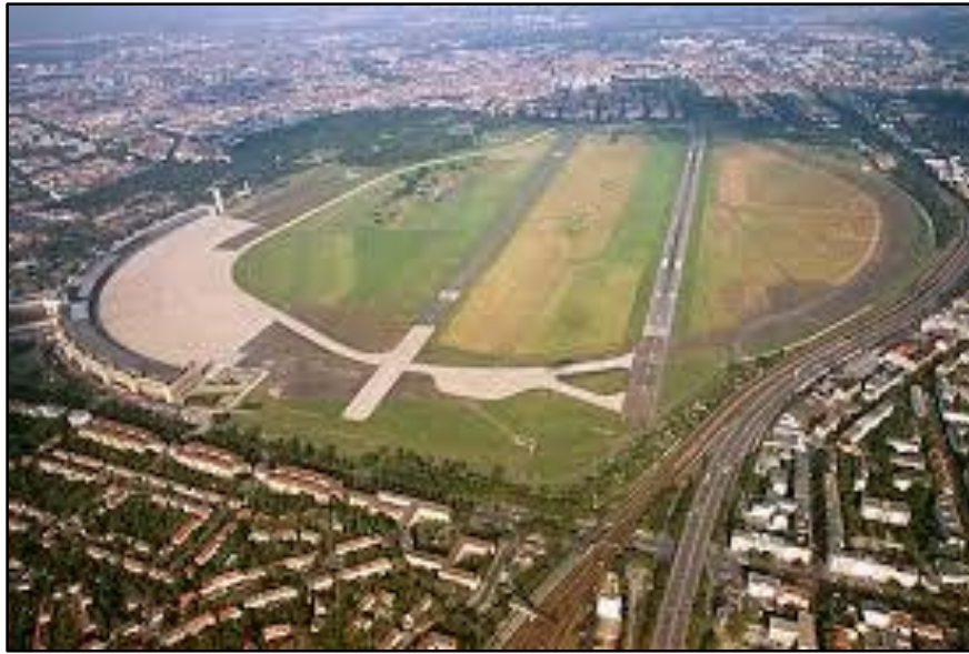
Figure 7. General View of Tempelhof

developer which would integrate citizens' rights to the city from the beginning of project planning. On June 2013 the second phase of the referendum took place. An overwhelming 730.000 votes against the plans of the government stopped a planning process which is believed to have costed some 9 Million EUR. In the future it will be the tasks of politicians to transfer the referendum results in a new law for the protection and use of the Tempelhof Airfield.