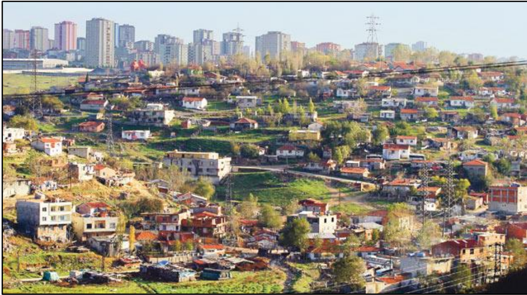
Figure 3. Derbent Neighborhood in Sariyer-Istanbul

capital investments. Derbent is one of these neighborhoods first formed in 1937 after industrialization around the neighbourhood and until today its population increased to 10.000 inhabitants. Until the 1990s residents of the Derbent neighbourhood provided their own public services and utility infrastructure (roads, water,...) where development was mainly based on 1 storey squatter houses. Ever since most buildings have been transformed into 2 and 3 storey buildings (Figure 3).