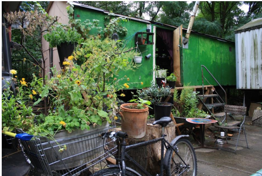
Figure 6: Convoi Caravan Park In Friedrichshain

inclusion of the Convoi group into their organization. In the year 2008 contracts between Convoi and Bremer Höhe e.G. were signed in which the cooperative grants a 15 years user right for the purpose of convoy members. After that the convoy members have an option to rent the land for another 14 years. In return Convoi members conveyed their option to buy the land from the Land Fund to the cooperative and became ordinary members of the Bremer Höhe e.G. For the case that claims about legal issues are raised against one or the other party of the contract, a guarantee to act on behalf of Convoi's interest has been included in the contract. The cooperation between the "Wagenburg" Convoi and the Bremer Höhe cooperative enables the former urban squatters to enjoy long term user right otherwise not existant in the legal framework of Berlin.