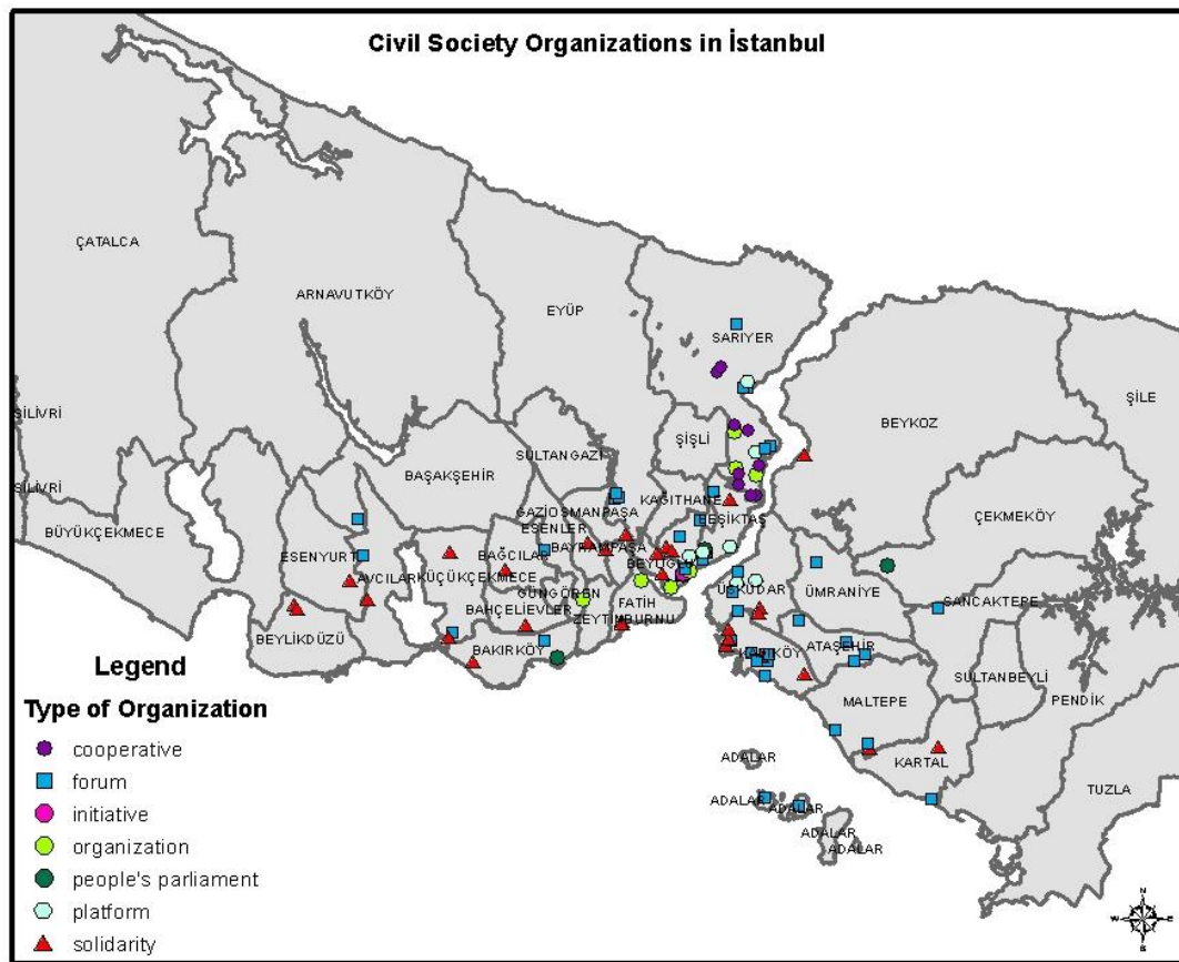
Figure 2. Newly Emerged Civil Society Organization in İstanbul

increasing number of initiatives, solidarity groups and forums conducting objections and protests against planning decisions. Figure 2 demonstrates newly emerged CSOs and their spatial distribution in İstanbul which generally coincides with areas subject to urban transformation