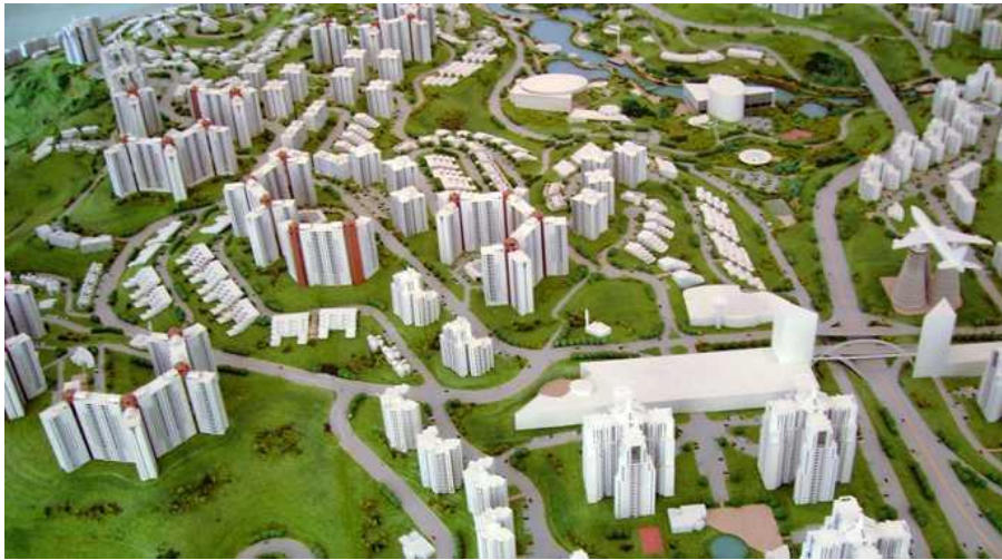
Figure 3.3 Saraycık Urban Regeneration Project

installations is prepared for the Districts of Saraycık and Ulubatlı Hasan. This project came to life after the demolition of the squatter houses located at the Çiñin Bağları District, which, security wise, is one of the most problematic areas of the Capital city and upon the settlement of the owners of the demolished squatter houses in Saraycık and Ulubatlı Hasan Districts. 4.800 residences will be constructed in the Saraycık District, and 6.200 residences and 160 workplaces in the Ulubatlı Hasan District” ( www.sincan.bel.tr ) (Figure 3.3).