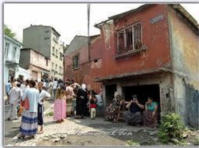
Figure 2.2 Depression at Çinçin

The daily newspaper Yeni Şafak , in its issue dated December 6, 2004, defines squatter housing areas as potential centers for crime and informs that the research done by the Police Departments of the cities Adana, Ankara, Antalya, İçel, İstanbul and İzmir, covering 16,144 convicts, has discovered that squatter housing areas and the streets where the homeless live are each a potential crime center. Another news item published in Hürriyet daily newspaper ( http://www.hurriyet.com.tr ), entitled “Çinçin District, known as Crime District” is changing skin” informs that as luxury housing replaces squatter houses as a result of urban regeneration projects initiated in the year 2005, wide avenues replace narrow and closed roads, and underlines that a crime center is saved by means of urban regeneration (Figure 2.2)