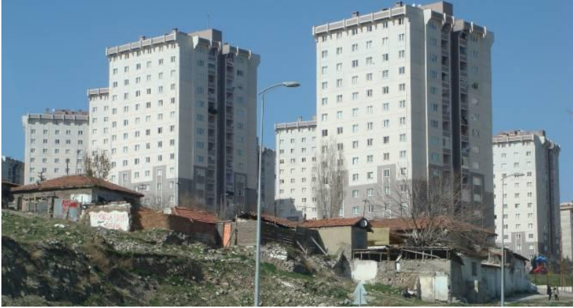
Figure 3.1. Altındağ Çiçin