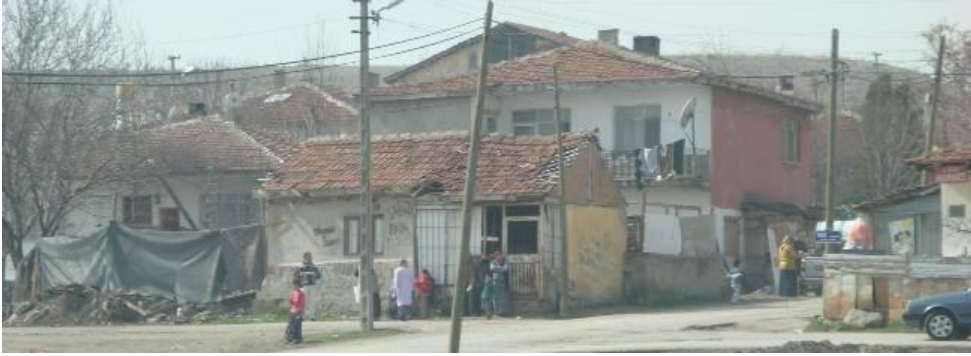
Figure 3.2. Sincan Saraycık