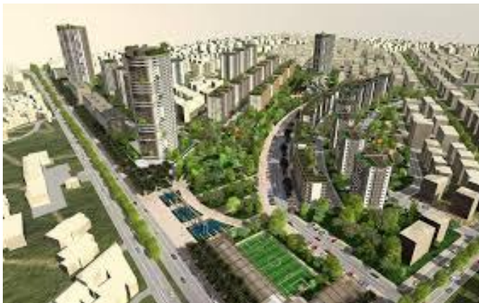
Figure 2.3. Advertisements

While at one end the media emphasize the transformation of squatter housing areas into areas of crime, the real estate compounds, on the other end, create a perception about how urban regeneration contributes to the real estate market (Figure 2.3).