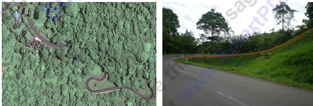
Figure 2: Existing Geometric Conditions in the Area of Babul National Park

Since 2007 until 2009, the Government has conducted a study and discussion for the planning of road development in an effort to improve the performance of Maros-Watampone road. This plan recommended to improvement three alternate geometric road construction options that can be applied to the elevated bridge, cut-fill and tunnel system. Implementation of the three construction alternatives could potentially have a negative impact on the environment. Thus, special attention is needed to the topography and geology, in particular, the choice of construction techniques and methods in order to maintain the sustainability of ecosystems especially in the National Parks and heritage areas on the sides.