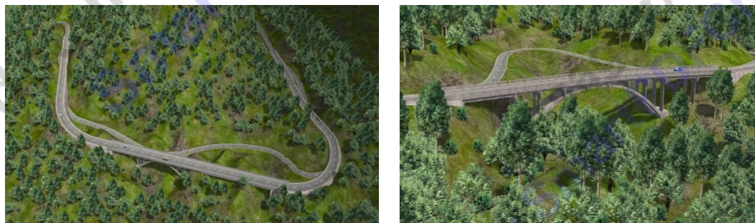
Figure 4: Simulation by the Elevated Bridge Construction

The assumptions of an elevated bridge construction design by considering some parameters through the land development program and 3dmax can be seen in Figure 4: