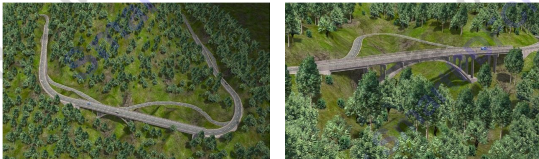
Figure 4: Simulation by the Elevated Bridge Construction

The assumptions of an elevated bridge construction design by considering some parameters through the land development program and 3dmax can be seen in Figure 4: