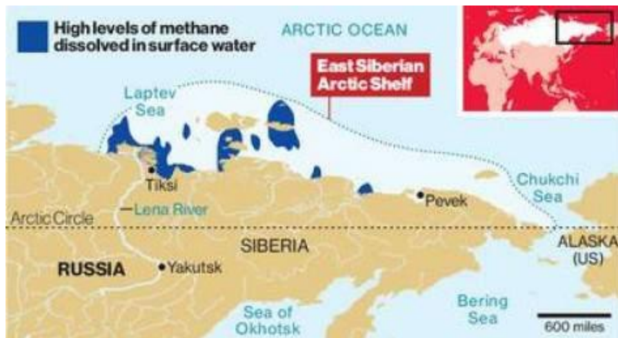
Fig.2. Deposits of methane hydrates on Eastern Siberian shelf

Natural conditions in the Laptev and East Siberian Sea authors favor the proposed mining technology methane (small depth, small fluctuations in sea level, the absence of strong currents, etc.), so the development and implementation of this technology can be implemented in just 3-5 years. With high probability we can assume that during this time the intensity of methane emissions will increase even more under the influence of global warming and the proposed technology will get a great development for the purpose of gasification of settlements on the eastern Arctic coast of Russia. For development in Russia this promising field of energy to develop new technologies for extracting methane in 2013 to the state and national levels to plan and carry out the initial research on issues related to the feasibility of technology and technical issues with the conceptual design of the underwater complex, including: