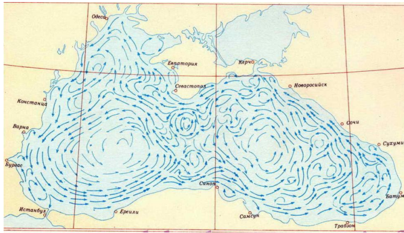
Figure 1. Map of currents in the Black Sea

The flow of contaminated water from the Romanian and Ukrainian sector of the sea shelf, where the oil will be produced on a large scale, can be deadly to the nature of the Bulgarian coast. A similar danger threatens and the nature of the southern coast of the Crimea. Even now, in the absence of production at the Pallas and in the Russian sector of the shelf, there are extensive oil slicks in the north-eastern part of the Black Sea (Fig. 2).