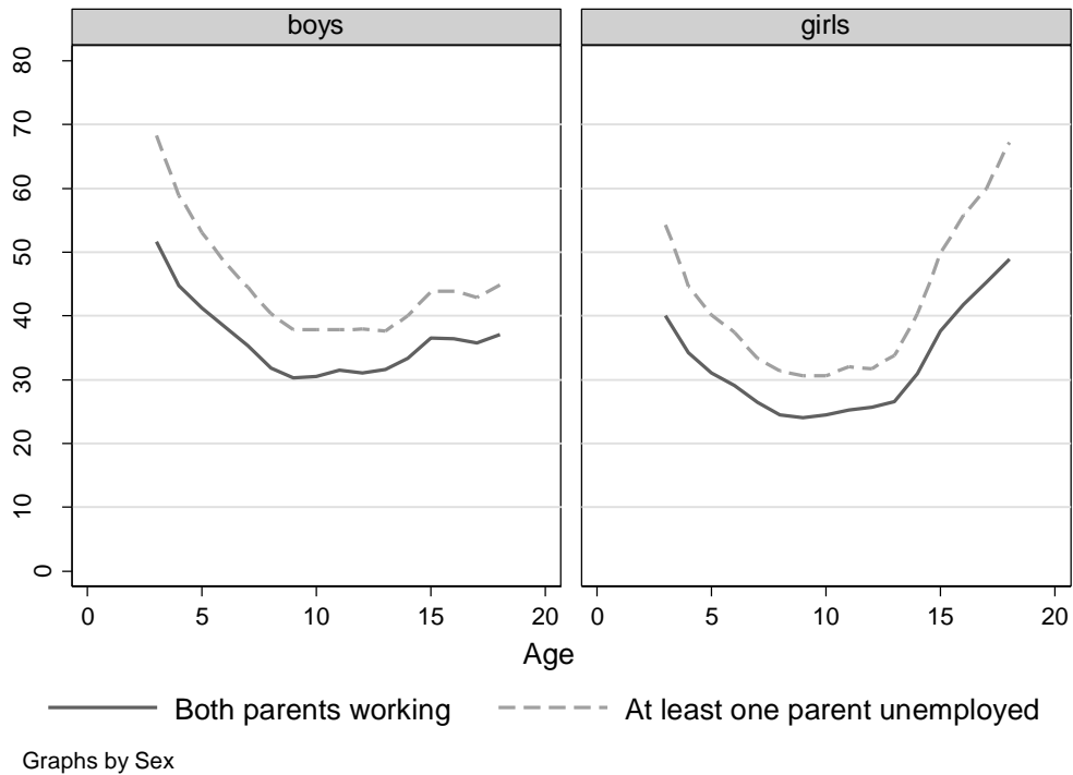
Figure 1 Hospitalization per 1 000 children, by parents' employment status. Boys and girls, ages 3-18, in 1992-2007.

unemployment status. The dashed line shows the number of children out of a thousand who are hospitalized at some point during a year at a particular age whose parents are unemployed and the solid line shows the corresponding number for children whose parents are not unemployed. The left figure shows the age-health profiles for boys and the right figure shows the profiles for girls.