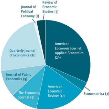
Figure 1: Published RCTs between 2009 and 2014 (92 studies included in total, frequencies in brackets)

Figure 2 depicts the regional coverage of the surveyed RCTs. The number of RCTs implemented in Kenya is due to the strong connection that the two dominating organizations that conduct RCTs (Innovation for Poverty Action, IPA, and the Abdul Latif Jameel Poverty Action Lab J-Pal) have to the country. Most of their studies were implemented in Kenya’s Western Province by the Dutch NGO International Child Support (ICS), for long IPA’s and J-Pal’s cooperation partner in the country. 8