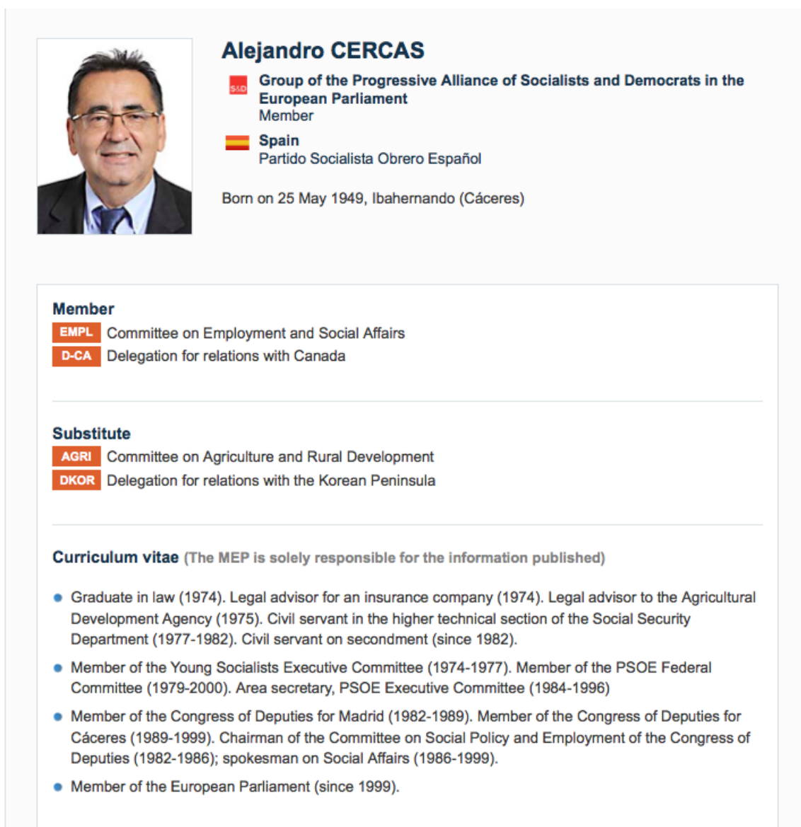
Table A.1: Example of an entry for a Spanish Member of the European Parliament

Sources: www.europarl.europa.eu/meps/en/4337/Alejandro_CERCAS.html , visited on 13.08.2012.