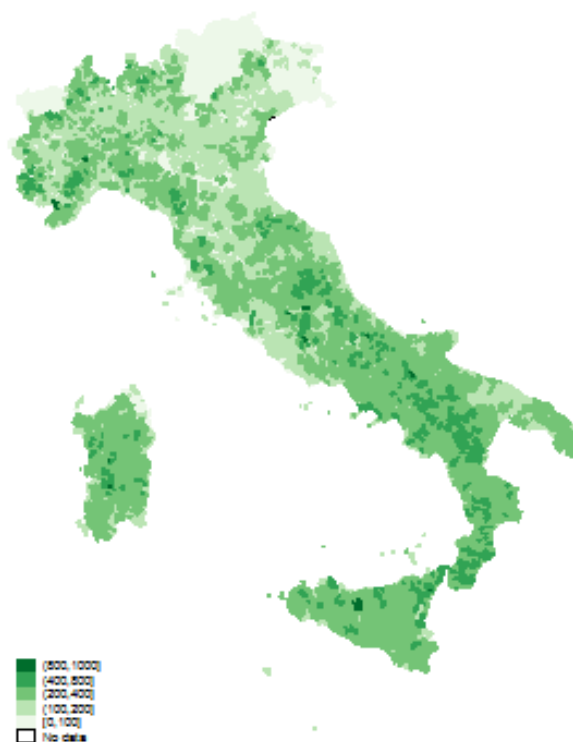
(A) TOTAL STATE TRANSFERS BY MUNICIPALITY, LEGISLATURE 1996-2001