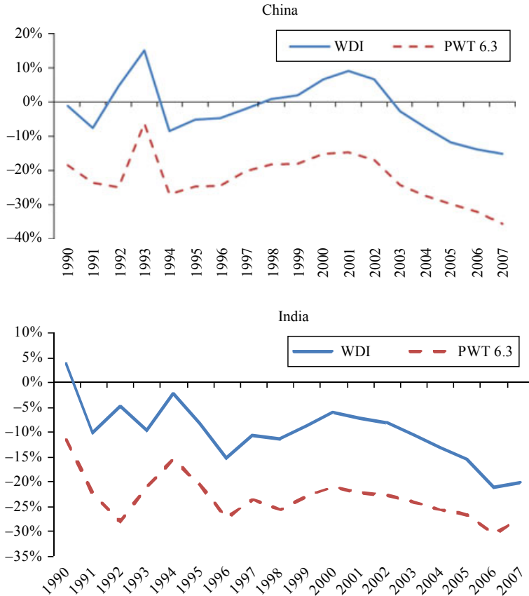
FIGURE 3 China and India: Harrod-Balassa-Samuelson-implied misalignment between 1990 and 2007