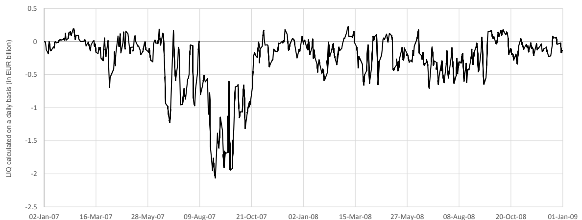
(c) LIQ with the equal-weighted average maturity on a daily basis