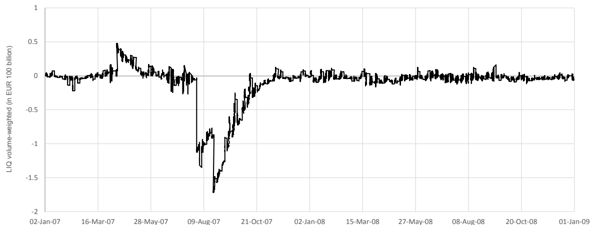
(b) LIQ with the volume-weighted average maturity