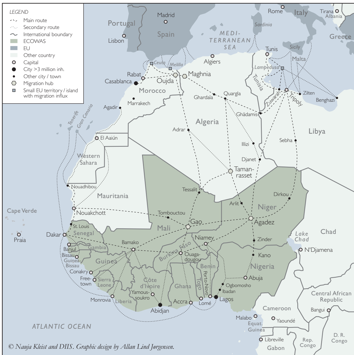
Simplified map of international migration routes in and from West and North Africa