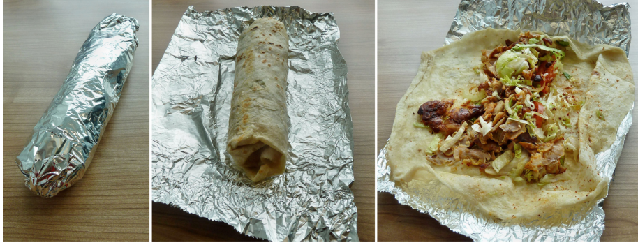
Figure 1: Pictures of durum doner: wrapped in foil (left), wrapped without foil (middle) and unwrapped (right).

salesperson i on each of five consecutive days . An individual experimenter's role (i.e., treatments NORMAL, TIP or COMPLIMENT) was fixed for each salesperson. We furthermore strove to ensure that all experimenters always interacted with one and the same salesperson in a given restaurant. We thus designed the experiment to obtain 15 observations per salesperson (three treatments/experimenters, and five observations each). To control for experimenter effects we randomized the experiment. We applied each of the six possible assignments of treatments to experimenters ( N ORMAL- T IP- C OMPLIMENT or NTC, NCT, TNC, TCN, CNT, CTN) three times to cover the 18 restaurants in each town. Thus, each experimenter played each role six times (for five visits each) in each town. The experimenters entered each restaurant independently from each other and were never present at the same time in the restaurant. After concluding a transaction, each experimenter immediately weighed the product outside of the restaurant in a place where he was not visible from inside. He also filled in a standardized protocol documenting the transaction. The doner were then handed over to charities in the respective town, except for a small percentage consumed by the experimenters themselves. 6