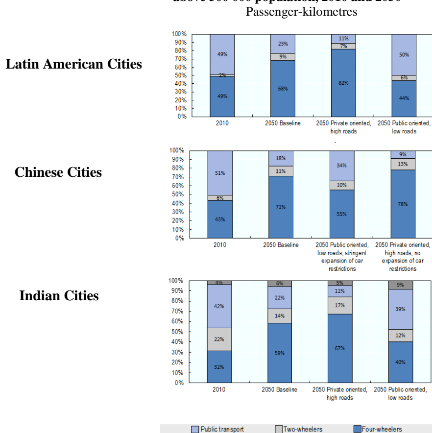
Figure 1. Modal shares under different policy scenarios in urban agglomerations above 500 000 population, 2010 and 2050

Note: Two-wheelers are powered two-wheeled vehicles, motorcycles and scooters, Four-wheelers are defined as passenger cars and light-trucks.