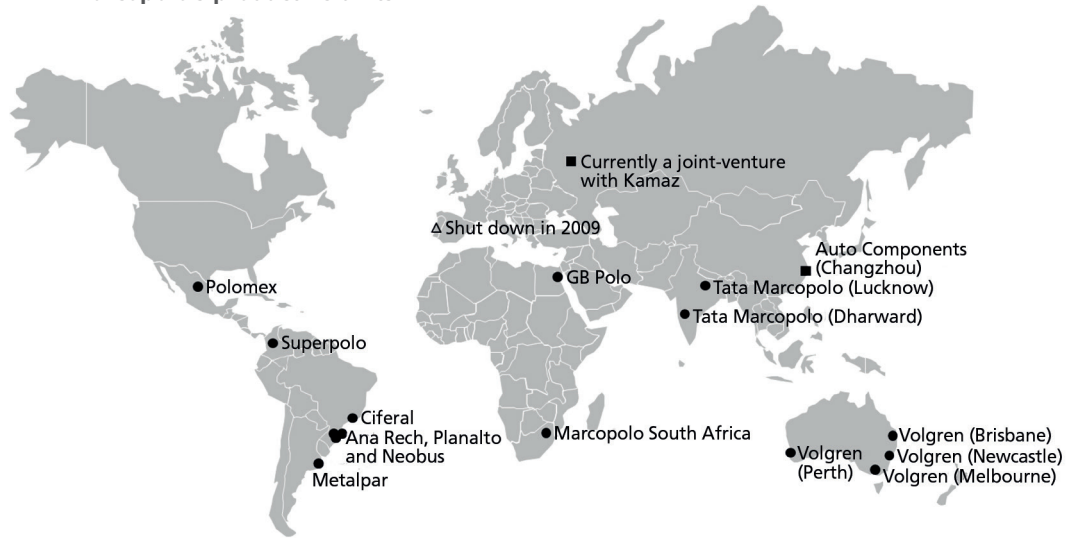
MAP 2 Marcopolo's productive units

As a result, Marcopolo currently controls a fourteen productive units abroad and four plants in Brazil (Marcopolo Ana Rech, Marcopolo Planalto, Ciferal and Neobus), 25 as shown in map 2 below.