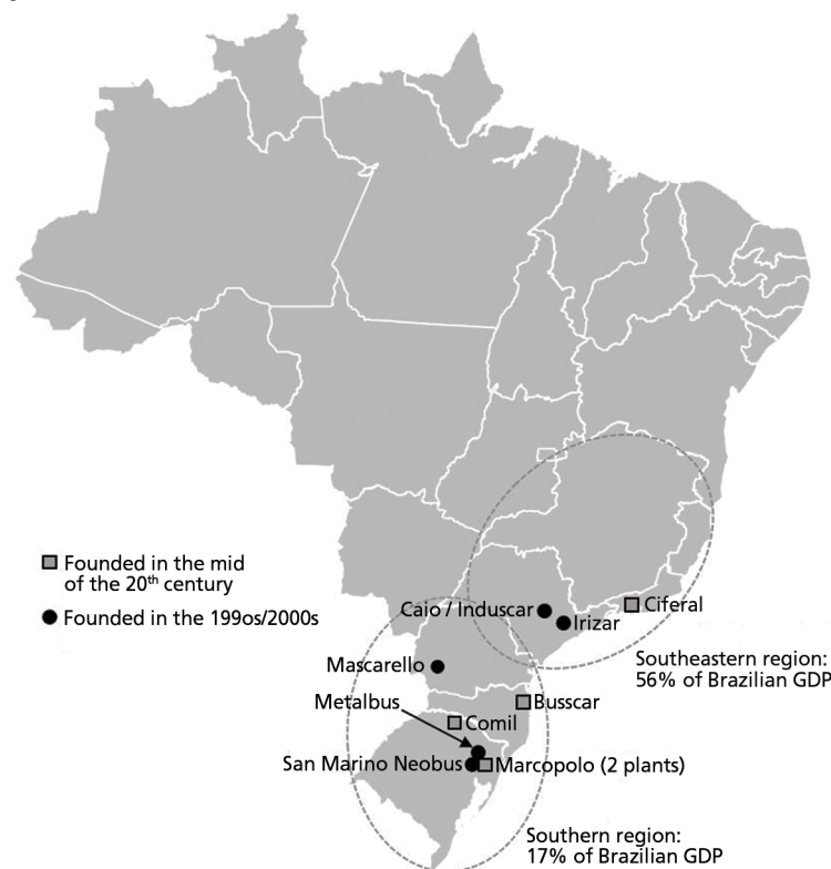
MAP 1 Bus bodywork manufacturers' location in Brazil