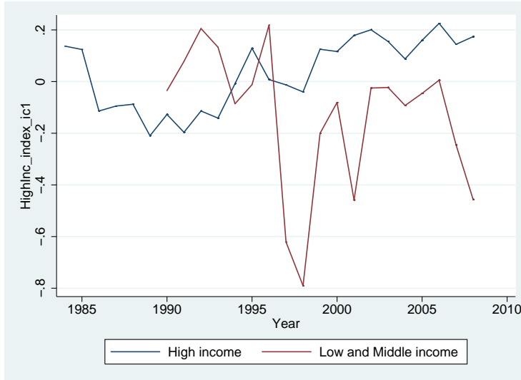
Figure 1 . Integration Index, by Income Group