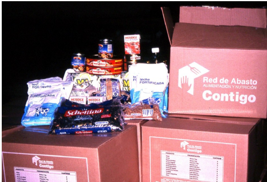
Appendix Figure 3: Unloading PAL boxes in the village