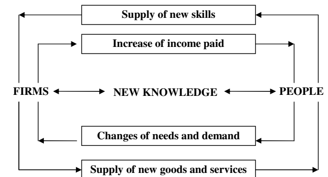
Figure 2: The process of urban growth and the creation of new needs and new skills

First, greater knowledge has an impact on the demand for and supply of labour. New knowledge induces firms to increase their demand for more skilled workers, and it induces households to supply more educated workers to firms. Firms exploit the new individual competencies of the workers and combine them in order to adopt the new production technologies needed for the production of new goods or services, and also in order to increase productivity in the traditional productions.