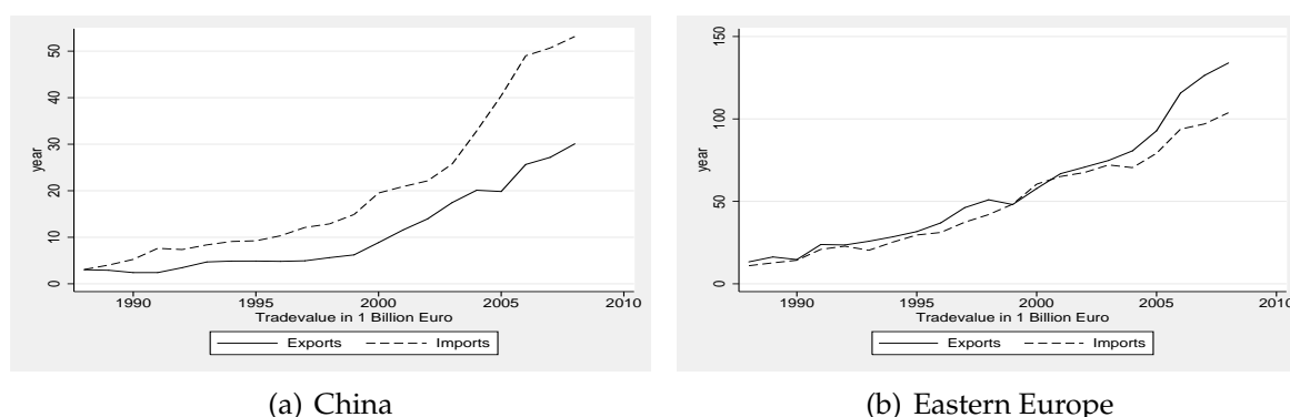
Figure 1: German Exports and Imports to/from China and Eastern Europe