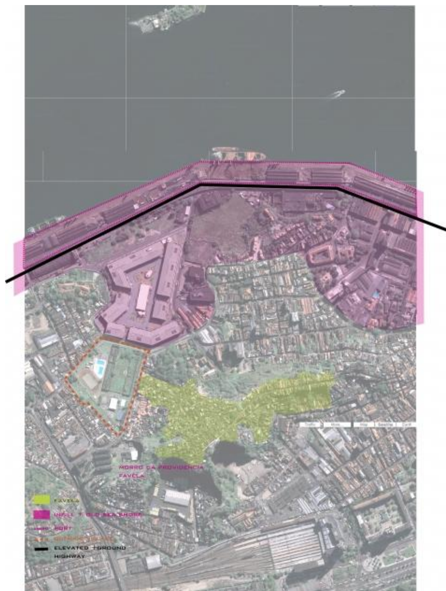
Fig. 6 – Building bridges between favelas and the booming event capital. Redevelopment project at Morro Providencia

Wrapping up, favelas may continue to be criminalized especially by the conservative media as “illegal” settlements reproducing violence. Yet, by involving approximately a million people, and providing unprecedented opportunities for disadvantaged youth groups that “officialist” cultural stances would never give, they cannot be neglected anymore as places of creative expression, as neither can the reality that such expressions portray and the claims advanced through it by local activists.