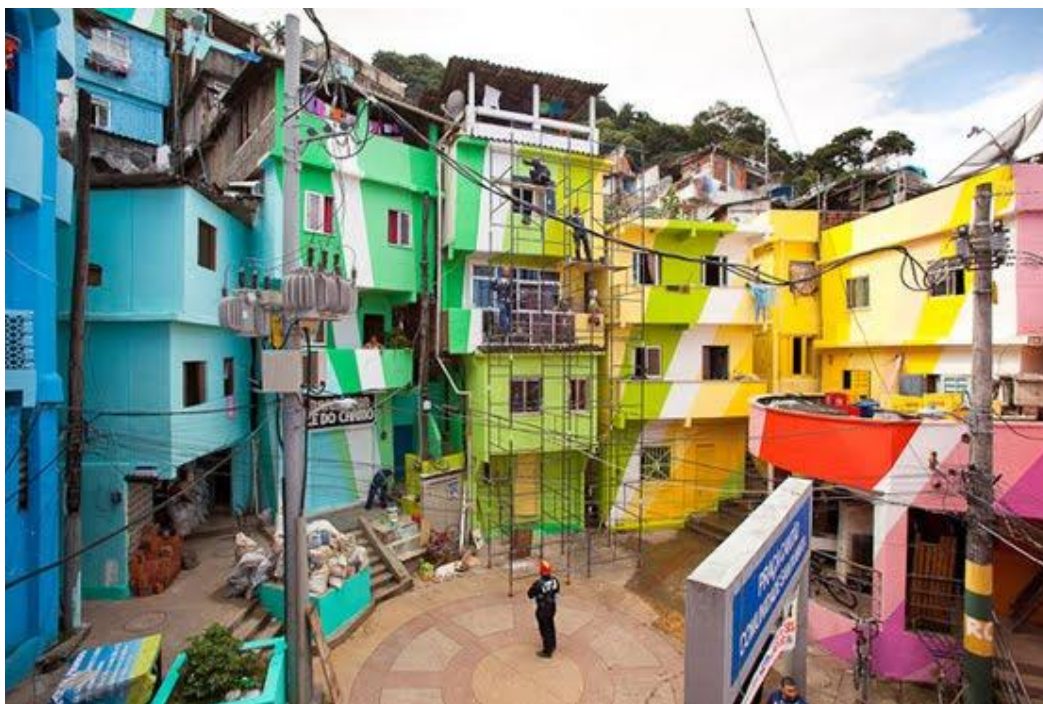
Fig. 4 – Creative design of favela landscapes

Rio’s favelas have been receiving visitors since at least a decade, when “Rocinha tours” started to be advertised on specialized websites and showcased in guidebooks such as Lonely Planet. These tours are strictly limited to groups accompanied by authorized guides and are backed up by NGOs that would “negotiate” visits with local gangs so as to ensure visitors’ safety. Visitors are picked up at their South Zone hotels, driven up Rocinha’s narrow alleys, and then they get to walk through these “forbidden” places, talk to local activists and simple residents, buy local products and crafts, and possibly