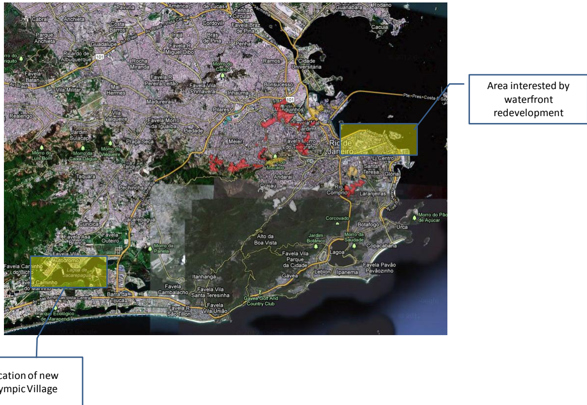
Fig. 1 – Location of Rio’s favelas and main redevelopment projects

It is nevertheless today acknowledged that progression in the construction of a more solid, “global” economic outlook cannot proceed separate to the solution of the city’s dire social problems (Urani 2008), although there is still a strong debate on whether the ongoing “corporatization” of the city should come first and be a lever for the reduction of poverty, or whether the latter issue should be given priority over boosterist development on ethical as well as sustainability grounds.