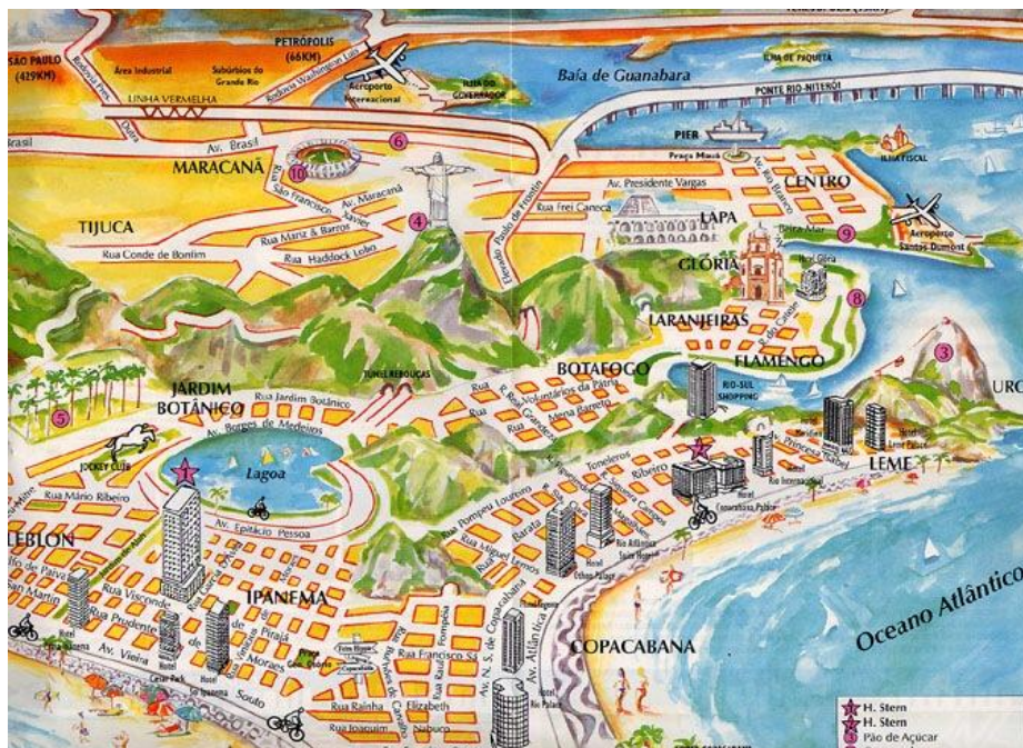
Fig. 5 – Negating the existence of favelas in official tourism representations

The success of visits to favelas has started a fashion of sorts: every weekend the South Zone youth virtually flocks to Rocinha to take part in “funk dances” and other events. Other poor areas of the immense suburb of Rio – like Madureira, the cradle of Samba schools; or Vigário Geral, with its very active “black” music and dance schools; and the municipality of Nova Iguaçu, an epicentre of grassroots theatre products – have started to be visited by small numbers of unorganized tourists, moved by curiosity for a “genuine” encounter with local contemporary culture, but also by the large exposure