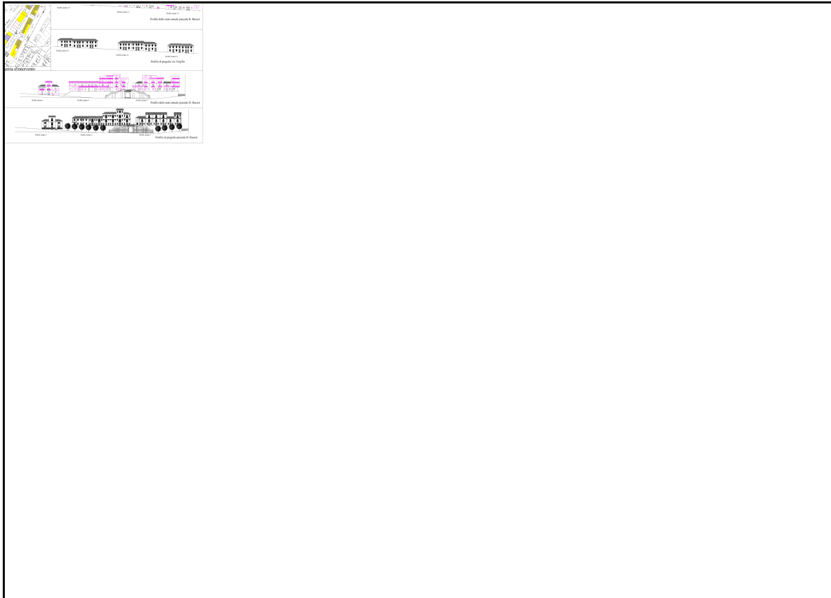
Figure 4 – Urban project “Piazzale B. Buozzi”