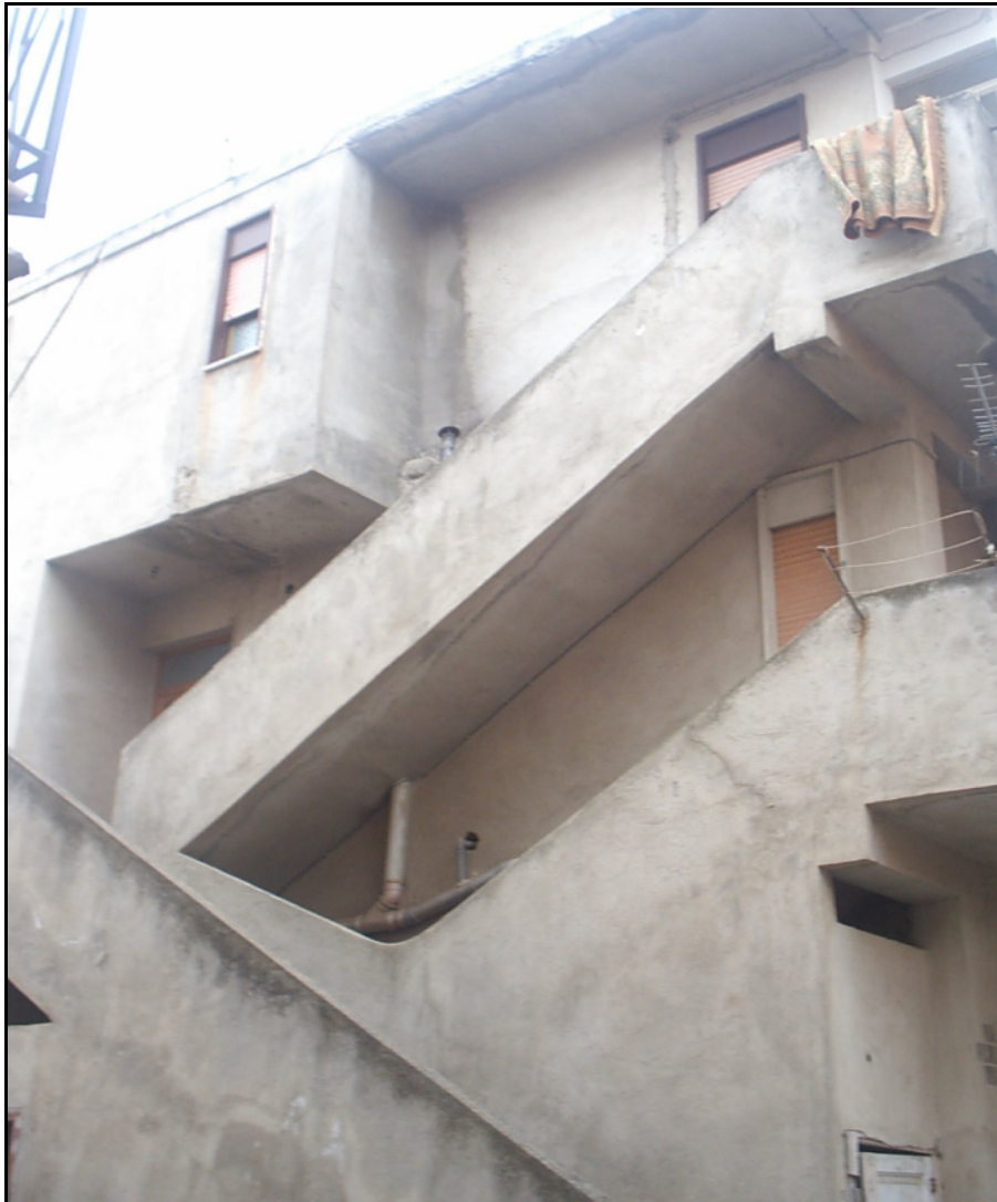
Figure 3 – Unauthorized interventions