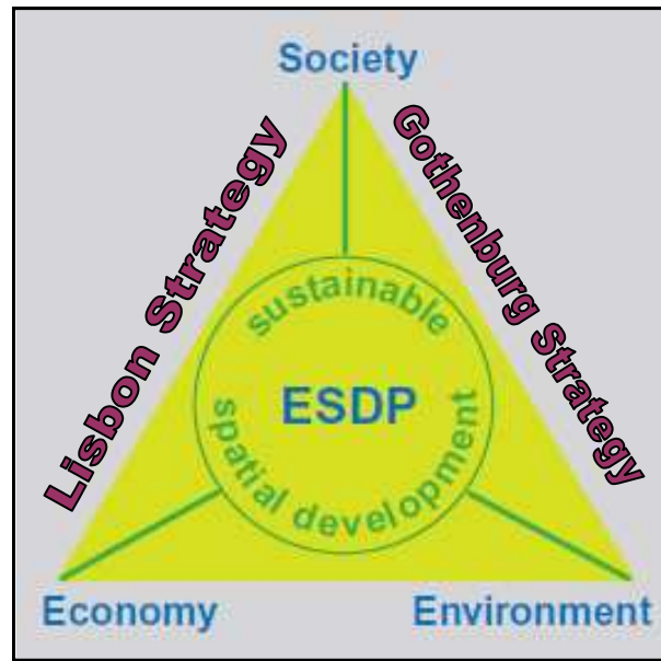
Figure 1: Triangle of the ETS objectives combined with the Lisbon and Gothenburg Strategies