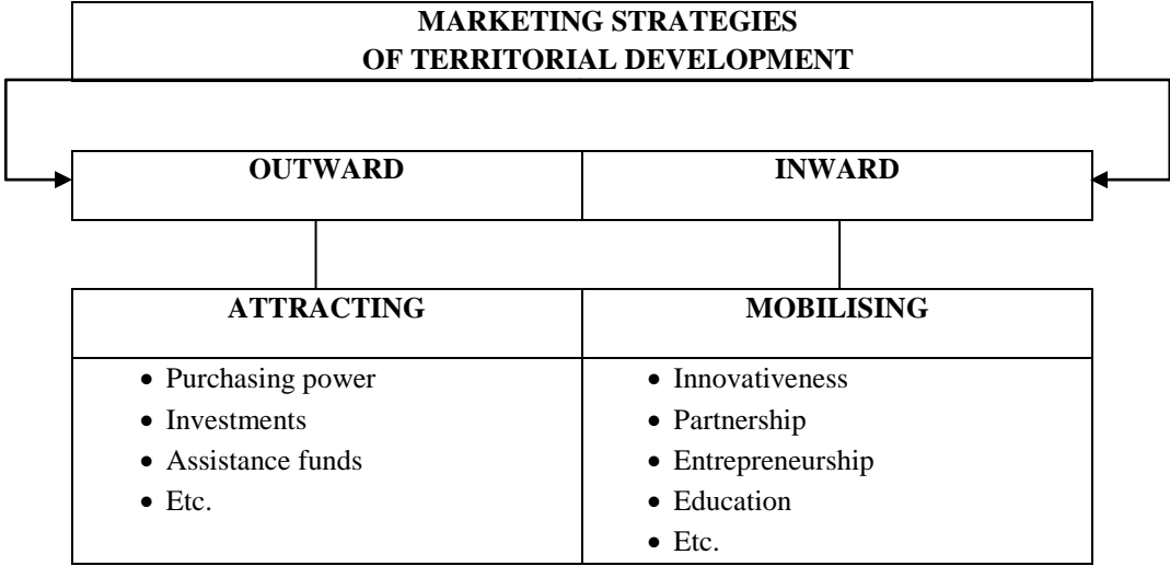
Figure 1: Principal categories of marketing strategies of territorial development

Source: Rudolf, W. (2008), Place marketing as the integrated approach to attract FDI. The case of the city of Lodz in Poland , COPE USA