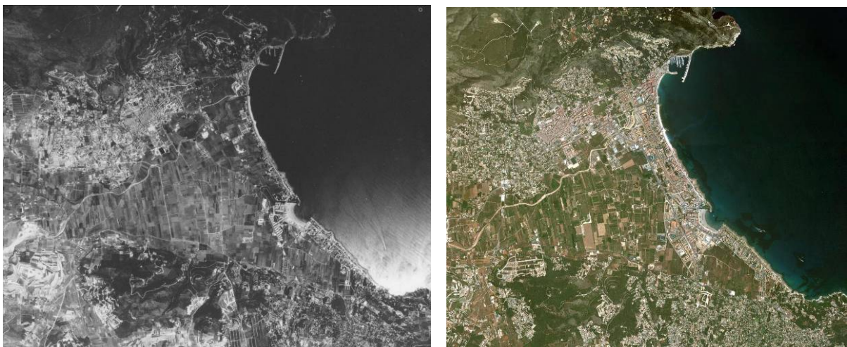
Figure 2. Jávea 1984 and 2009.

the traditional urban centre has become consolidated, together with areas linked to roads connecting the town with outlying areas. In Jávea, the urban centre has spread towards the coast, establishing a new continuous area between the historic part of the town and areas of coastal use, and occupying the town's coastal strip to a width of almost half a kilometre which up to the 1970s had received only low levels of artificialisation. In the case of Calp, the little coastal space that existed prior to the period in question has been saturated, with all land between the urban centre and the Peñón de Ifach being used.