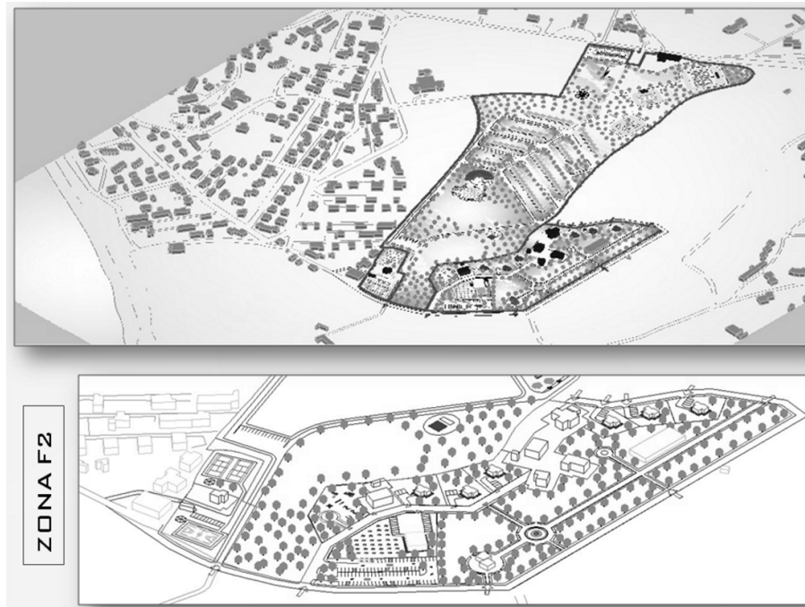
Figure 3. A sketch of Plan 2 (Elaborated by Arippa and Lombardo, cit. in footnote 6 )