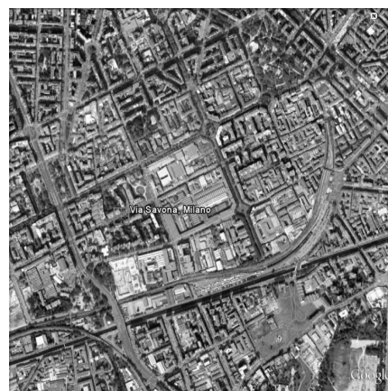
Fig. 6. Savona/Tortona area in Milan is an urban post industrial district. It regards the concentration of fashion and creative cluster in a historical neighbourhood of Milan.