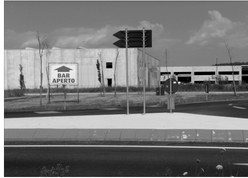
Fig. 13, 14 Widespread warehouses in whichever Italian industrial district.

According to Viganò (2001) an innovative landscape and environmental policy cannot be restricted to the protection and conservation of a certain number of contexts with particular aesthetic and natural prestige. It is my contention that it could be aimed to much more ambitious objectives. The porous characters of the “diffused” city (or urban sprawl) presents, in any case, play a critical role to emphasize the development of biodiversity and expansion of natural habitat.