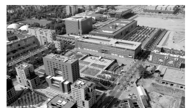
Fig. 15, 16, 17 Milan, Bicocca area around 1920 (with Pirelli and Breda industrial buildings), 1980, and today (one's of Europe most innovative academic/industrial district).