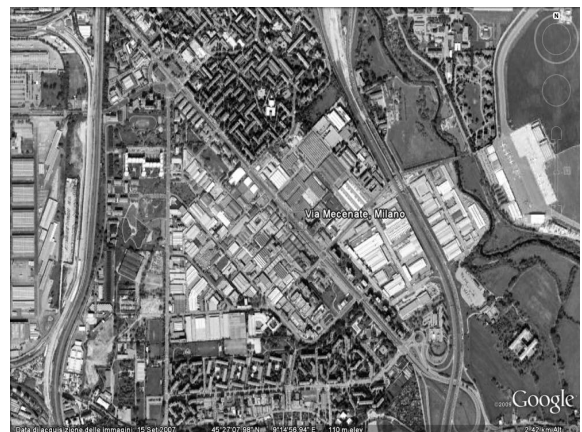
Fig. 2. Via Mecenate, Milan. A dense mixité of small firms, vacant buildings, commercial, logistic settlements, and residential units inside the compact city.