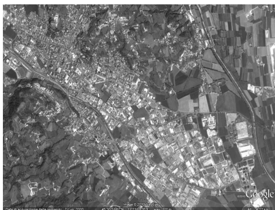
Fig. 5. Arzignano in Veneto Region, is the most important leather tanning Italian industrial district: in 2007 the municipality made the 0,1% of GDP. The high pollution due to the leather work process has transformed the production cycle in a more sustainable way.