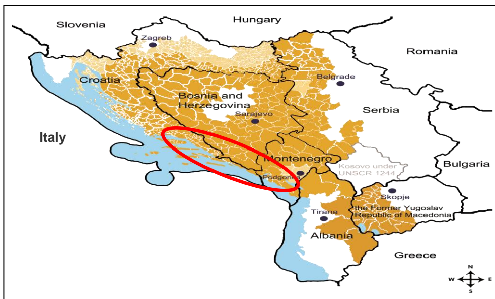
Map 1. Cross-border cooperation Programmes between Croatia and neighbouring countries

The Integrated Pre-accession Assistance (IPA) Cross-border Cooperation Programme Croatia-Montenegro 2007-2013 is the basis for our research and sustainability evaluation. As recognised in the Cross-border Cooperation (CBC) Programme, the environment represents an important challenge in the cross-border area. The Programme's strategic orientation to sustainable development encompasses economic development, human resources development, social justice and environmental protection. The overall objective focuses on the development of the cross-border region through cooperation and networks following the guidelines and regulations provided by the European Commission (EC) through the IPA Implementing Regulation. Specific objectives focus on development of SMEs, tourism, trade,