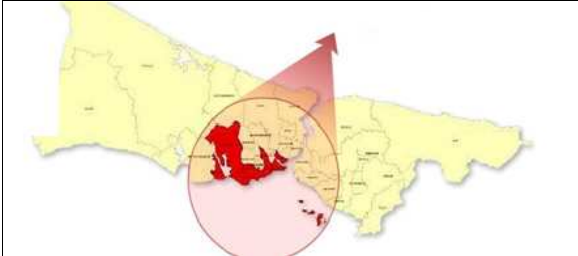
Figure 3: The Areas Under High Risk in Istanbul (Istanbul Metropolitan Municipality)

All of these projects led to different degrees of community reaction. In Basaksehir (formerly Kucukcekmece), homeowners opposed to being moved to smaller units, and the reactions to having to move an isolated and drastically different living environment, led the municipality to offer some social programs, such as psychological support, career development courses, activities for women. In Fatih, destruction of the 2000 year old Roma community (Sulukule) create reaction for removal of its residents to high rise buildings outside the center city. Zeytinburnu, was in a relatively more advantageous situation, despite the low and moderate income levels its residents, since it was selected as a pilot district by the Metropolitan municipality for mitigation activities and urban transformation. A participatory planning process was undertaken in Zeytinburnu municipality in Sumer and Merkez Efendi neighborhoods (Figure 4). The Matra Regina Project, initiated by a proposal by the Dutch Ministry of International Affairs, was carried out in partnership between the district municipality and the Istanbul Technical University. Merkez Efendi project involved working with residents of a single urban block, and was more successful since it involved residents from the beginning of the process, and turned out to be a learning process for both the residents and district officials (Yönder and Türkoğlu, 2011).