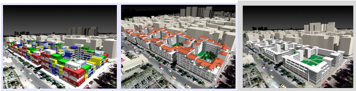
Figure 4. Design Alternatives for Sumer Neighborhood (Istanbul Metropolitan Municipality)

All of these projects led to different degrees of community reaction. In Basaksehir (formerly Kucukcekmece), homeowners opposed to being moved to smaller units, and the reactions to having to move an isolated and drastically different living environment, led the municipality to offer some social programs, such as psychological support, career development courses, activities for women. In Fatih, destruction of the 2000 year old Roma community (Sulukule) create reaction for removal of its residents to high rise buildings outside the center city. Zeytinburnu, was in a relatively more advantageous situation, despite the low and moderate income levels its residents, since it was selected as a pilot district by the Metropolitan municipality for mitigation activities and urban transformation. A participatory planning process was undertaken in Zeytinburnu municipality in Sumer and Merkez Efendi neighborhoods (Figure 4). The Matra Regina Project, initiated by a proposal by the Dutch Ministry of International Affairs, was carried out in partnership between the district municipality and the Istanbul Technical University. Merkez Efendi project involved working with residents of a single urban block, and was more successful since it involved residents from the beginning of the process, and turned out to be a learning process for both the residents and district officials (Yönder and Türkoğlu, 2011).