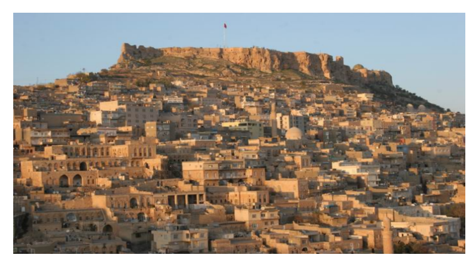
Figure 2. A scene from Mardin traditional settlement