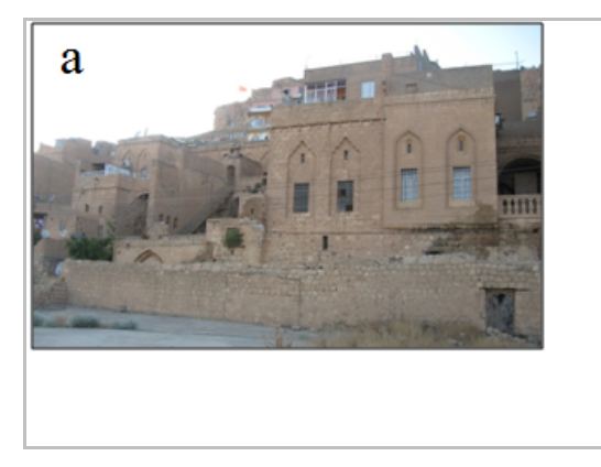
Figure 2a. Example of a traditional house

Home for a plenty of civilizations, Mardin is one of our cities which has been able to bring the artifacts and the rich cultures of the societies living on its lands for centuries. With the growing consciousness that the urban texture, which has been designated as decrepit and primitive until the 1980s, is actually art and civilization, initiatives to protect this texture started. Real estates in Mardin city center were registered and maintained as "Immovable Cultural Assets that Must be Protected" in accordance with the Law numbered 2863 as a result of the decision taken by Ministry of Culture and Tourism Immovable Cultural and Natural Assets High Council in 1985. Several houses at city center, Ottoman bazaars, and official buildings with historical-architectural value, older artifacts and Mardin Castle have been registered and included in the list of "artifacts and buildings that must be protected".