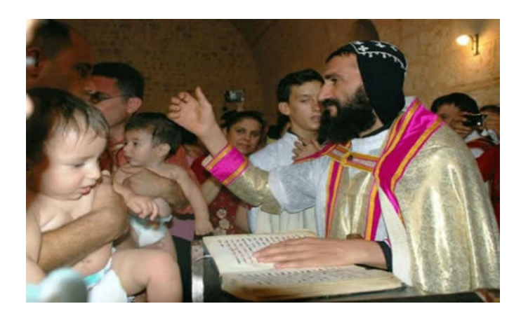
Figure..A religious ceremony of Syriacs

The present study area not only comprises one of the oldest urban life regions but also bears the habits and traditions of "coexisting in variety" required by urban life. Syriacs, Muslims, Turks, Kurds are neighbors to each other. Food has a traditional side to it with the plants grown in the region, climate and lifestyle. Mardin cuisine owns its richness to special foods prepared for religious ceremonies of various faith systems, traditional days after birth and death, and rituals.