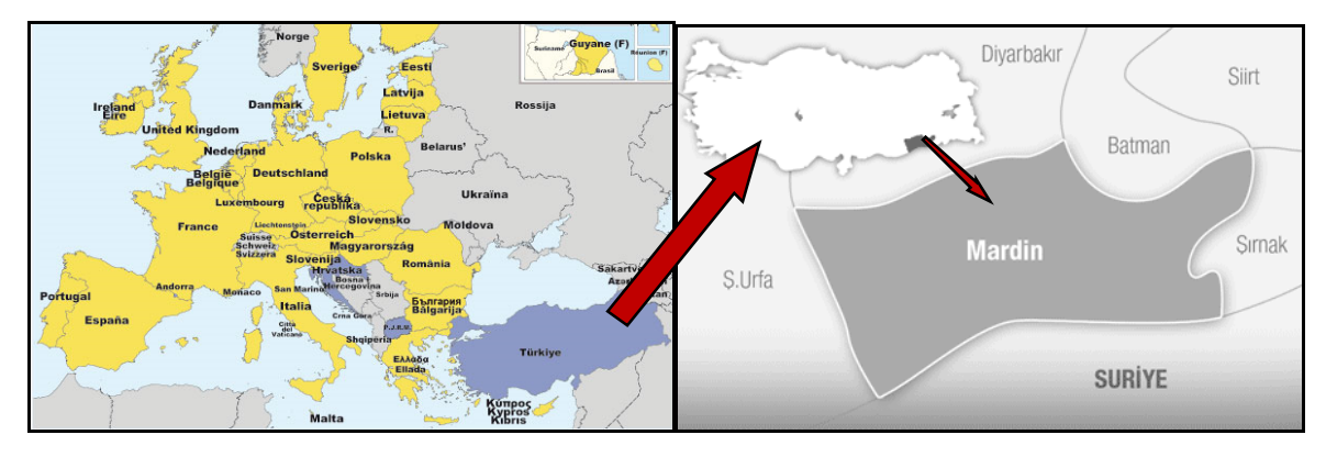
Figure 1. Location of the study area

Mardin, a medium sized city located on the South-eastern region of Turkey, is one of the oldest cities of the upper Mesopotamia. It is situated on a 1325-meter plateau, at the western end of the region known as Tur Abdin in history and on the southern slope of a hill overviewing the Diyarbakır-Nusaybin road (Alioğlu, 2005).