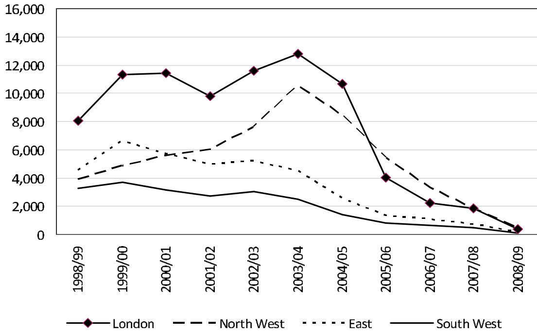
Graphs 2B: Number of RTB sales by selected regions in England: 1998-99 to 2008-09