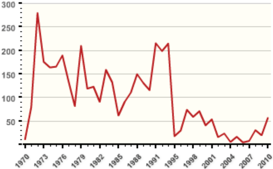
Figure 1: Terrorists incidents in Northern Ireland by year (Source: GTD, START (2011)).

The data used in this paper includes approximately 1,300 incidents perpetrated by Republican organisations and 650 perpetrated by Loyalists, which could have occurred at any one of over 150,000 points in space and time. Indeed, these problems are confirmed by the application of OLS and panel data techniques to the dataset. In order to overcome these data variation issues, I employ duration analysis, which treats each pair of attacks, or more specifically, the duration between these two attacks, as an observation. This contrasts with the daily unit of observation inherent in the use of traditional linear techniques. The presentation of this data in a panel formation is suited to duration analysis.