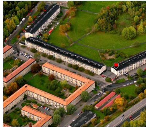
Fig. 6 Grimsta, built during the late 1950-ies and early 60-ies. Three to four stories, blocks of flats arranged around green courtyards. Parking mostly along streets or smaller parking lots