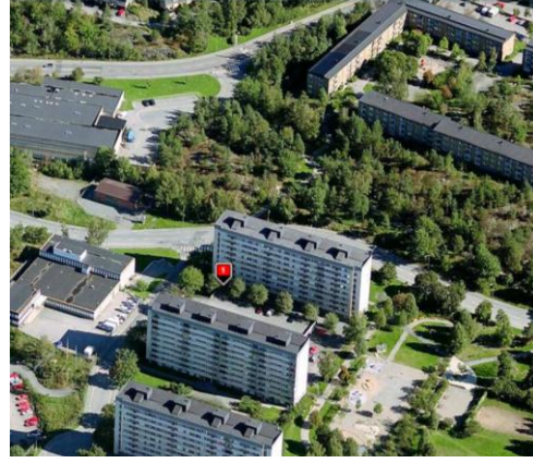
Fig. 4 Sättra, built during the early 1970-ies. Free standing higher blocks of flats mixed with lower buildings, green areas between groups of buildings. Big parking lots between buildings