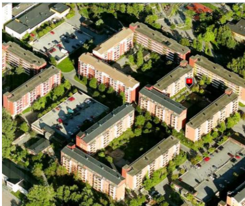
Fig .5 Husby, built during the mid 1970-ies. Higher blocks arranged around courtyards. Creating a more urban environment was a goal, which led to a rather dense built environment with higher buildings concentrated along the subway