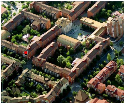
Fig 7 Skarpnäck, built during the 1980-ies. The planning ideal then was a more urban environment. Closed blocks arranged within a grid iron street pattern and 6-7 storey buildings were the physical characteristics