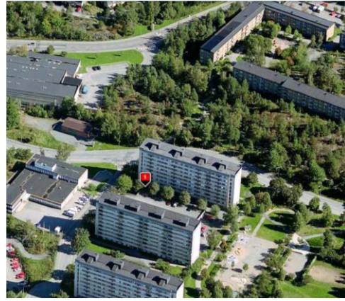
Fig. 4 Sättra, built during the early 1970-ies. Free standing higher blocks of flats mixed with lower buildings, green areas between groups of buildings. Big parking lots between buildings