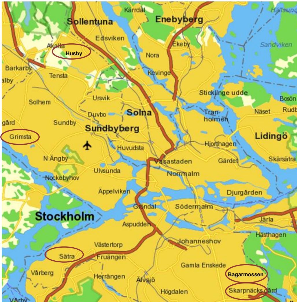
Figure2. Stockholm region. The city centre is around the place marked Norrmalm. The studied locations are marked with circles around their names