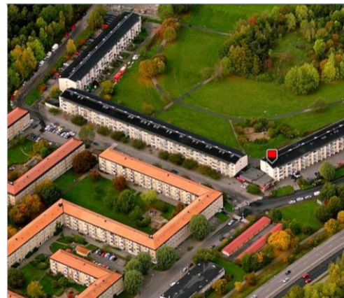
Fig. 6 Grimsta, built during the late 1950-ies and early 60-ies. Three to four stories, blocks of flats arranged around green courtyards. Parking mostly along streets or smaller parking lots