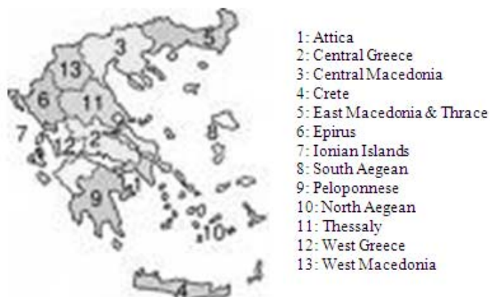
Figure 2: Map of the Greek Administrative Regions

The methodology presented in the previous section is now applied to the case of the thirteen Greek regions as shown in Figure 2. Before proceeding to the calculations we briefly present the characteristics of those regions.